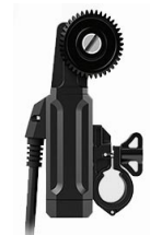
CLM-5 (Basic Set) K2.0006361