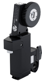
Controlled Lens Motor CLM-4 (Set) K0.60185.0