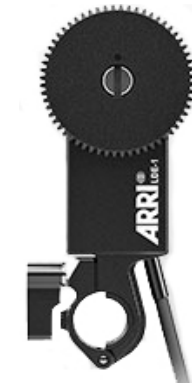
Lens Data Encoder LDE-1, K2.0002680