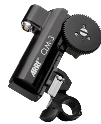
Controlled Lens Motor CLM-3 (Set) K0.60057.0