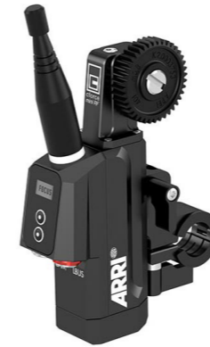
cforce mini RF Basic Set 2 , KK.0040345