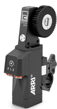
cforce plus (Basic Set) K0.0010103