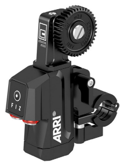
cforce mini Basic Set 2 KK.0040344