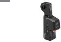
cforce mini Motor Unit K2.0006354