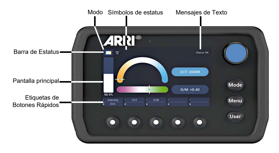
Pantalla mostrada con menú cerrado, modo CTT