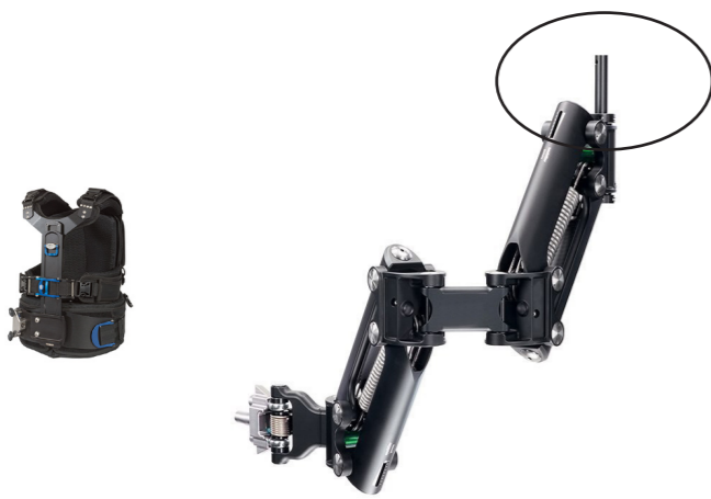
artemis Vest, K2.0010333