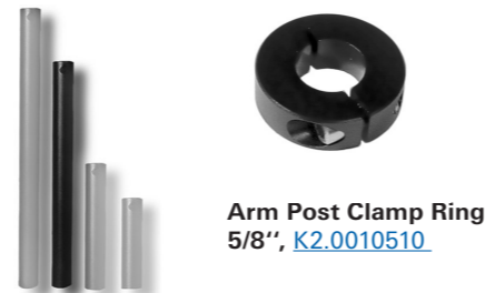
Arm Post Clamp Ring 5/8", K2.0010510

Arm Post 10" - Ø 5/8" K2.0010455 Arm Post 12" - Ø 5/8" K2.0010456