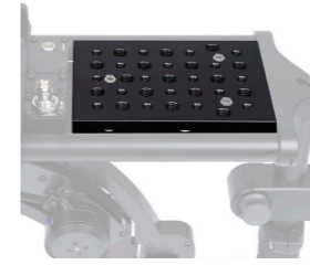
Maxima Mounting Plate K2.0014909