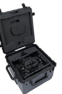
Hard Case for Maxima MX30 K2.0010529