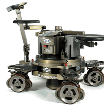
Dollie with Euro Mount