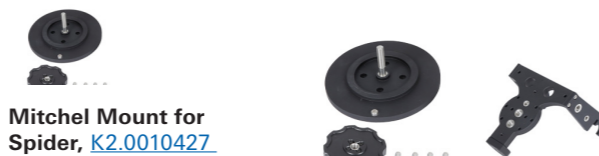
Mitchel Mount for Spider, K2.0010427

MAXIMA Mounting Pro Set includes: Top Holder for Maxima Spider for Maxima Euro Mount for Spider Mitchell Mount for Spider