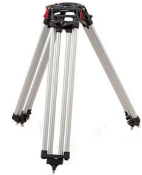
Tripod with Mitchell Mount