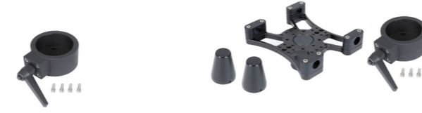
Euro Mount for Spider, K2.0010426

K2.0010336 K2.0010425 K2.0010426 K2.0010427