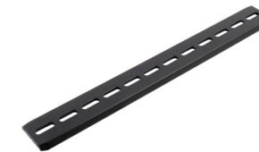
Extra long QL Plate Gen 2 for SRH-3, TRINITY, MAXIMA, K2.0033425