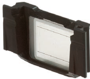
ALEXA Studio Ground Glass

The physical frames of ALEXA Studio ground glasses and frameglow masks are the same as those used in ARRICAM film cameras.