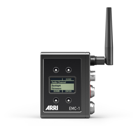
Fig. 1: Control Panel

The EMC-1 features a user interface enabling the user to quickly configure the system. The 1.2" transflective LCD display shows vital status information and is easily readable in any ambient light conditions.