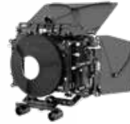
Lightweight Matte Box LMB 4x5