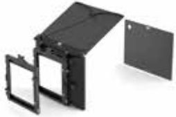
Clamp-On Set 3-Stage Set