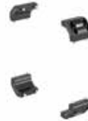
Vertical Format Adapter