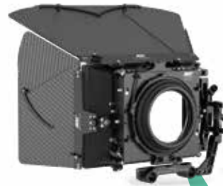
20 / Lightweight Matte Box LMB 6x6