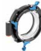
ARRI LPL mount for ALEXA Mini