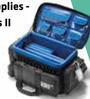
22 / Crew Supplies - Unit Bags II