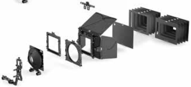
Pro 15 mm Studio Set Pro 19 mm Studio Set