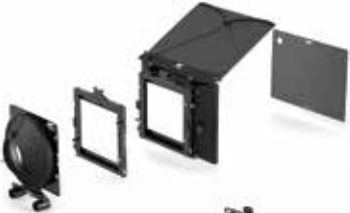
15 mm Studio 3-Stage Set 19 mm Studio 3-Stage Set