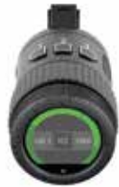
18 / Operator Control Unit OCU-1