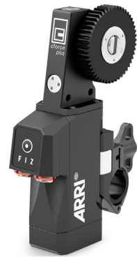
cforce plus (Basic Set) K0.0010103