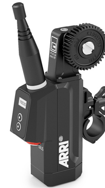
cforce mini RF Basic Set, KK.0016804