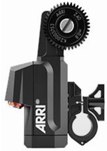
cforce mini (Basic Set) K2.0006355