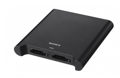
Sony SBAC-UT100 or other SxS card reader