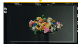
Assistant: Rec 709 on-board monitor with frame lines, surround view, status info and LDS info