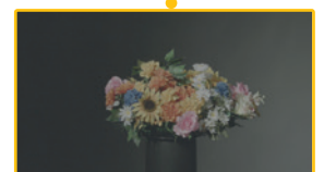
DIT: Rec 709 monitor with Log C, clean