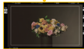
Operator: EVF-1 with custom look, frame lines, surround view and status info