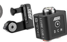
LCUBE CUB-1 Basic Set KK.0009001