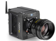
ALEXA Mini / ALEXA Mini LF

Cable UDM - EXT (16p) (0.5m/1.6ft) K2.65261.0 (yellow cable) Connects to EXT socket of ALEXA cameras with SUP 8.0 or later