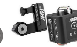
LCUBE CUB-1 Basic Set KK.0009001