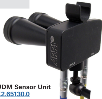
UDM Sensor Unit K2.65130.0

Cable UDM-Sensor (1,5m/5ft) K2.0006459 (blue cable) connects UDM Sensor and UDM Display