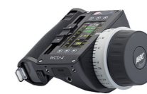
Wireless Compact Unit WCU-4, K2.72103.0