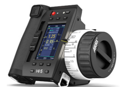
Hi-5 Hand Unit Body Set, KK.0039973 Radio Module needed

Cable UDM - SERIAL (7p) (1.5m/5ft), K2.65144.0 (yellow cable)