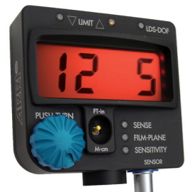
UDM Display Unit K2.65131.0